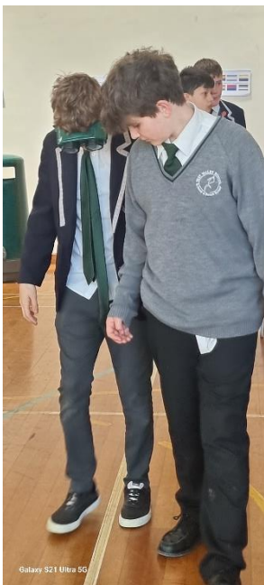
Photos from the NHS Roadshow this week